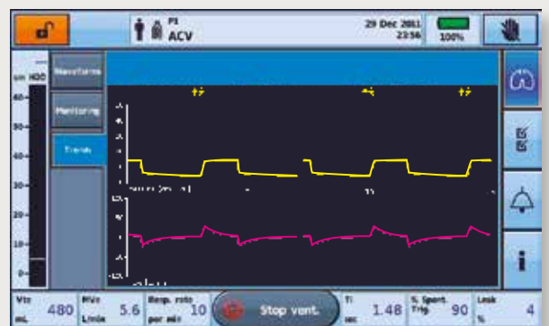
Real-time pressure and flow waveforms display essential therapy parameters on the large touchscreen.