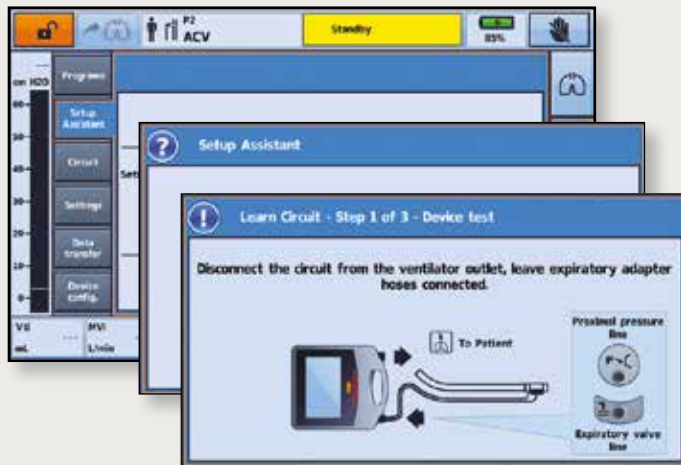
The built-in Learn Circuit feature evaluates and compensates for resistance in the circuit to optimise ventilation and deliver the right pressure and flow at the mask.