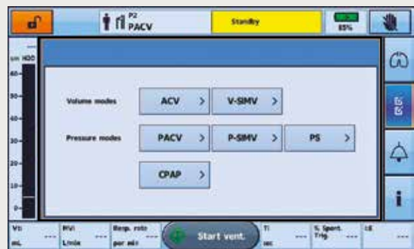
A full suite of modes offers versatile therapy options as the patient's condition progresses.

Real-time waveforms and patient information are displayed on the large colour touchscreen to ensure correct setup and to track patient condition. \text{FiO}_2 and \text{SpO}_2 are integrated to complete the therapy picture.